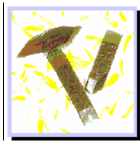
Rough full Crystal's