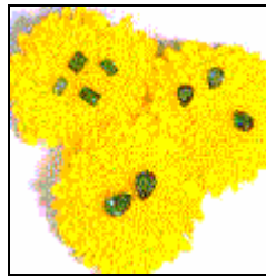
different cut stones